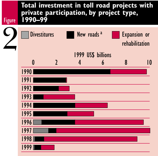
a. Concessions and greenfield projects. Source: PPI Project Database.

More than half of the private activity in toll roads has taken place in Latin America. In this