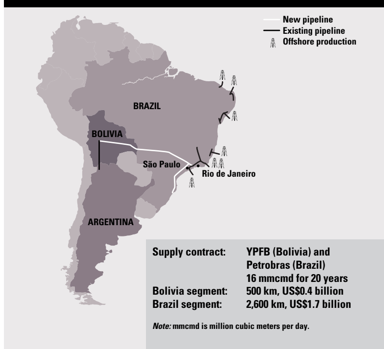
FIGURE 1 THE BOLIVIA-BRAZIL NATURAL GAS PIPELINE

When the pipeline project started to get off the ground in the early 1990s, the Brazilian hydrocarbon sector was dominated by government-owned entities and prices were heavily regulated. At the federal level the oil and gas company Petrobras, the main player in the project, still had a monopoly on exploration, exploitation, refining, and maritime and pipeline transportation. Natural gas distribution was reserved for state-owned distribution companies, although petroleum distribution was open to foreign investors. Prices were equalized across regions, and the prices of liquefied petroleum gas (LPG) and fuel oil were subsidized. For Petrobras exploiting Brazil's modest natural gas reserves had been secondary to producing oil, and the share of natural gas in the energy market in the early 1990s was a mere 2 percent. Petrobras had introduced natural gas only in 1988, supplying small quantities to the existing São Paulo distribution network as associated gas from local oil fields. 1 But with Brazil forecasting strong growth in energy demand, natural gas gained appeal as a means to offset increasing dependence on more