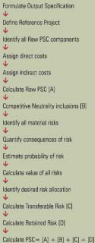
Figure 2: The PSC process