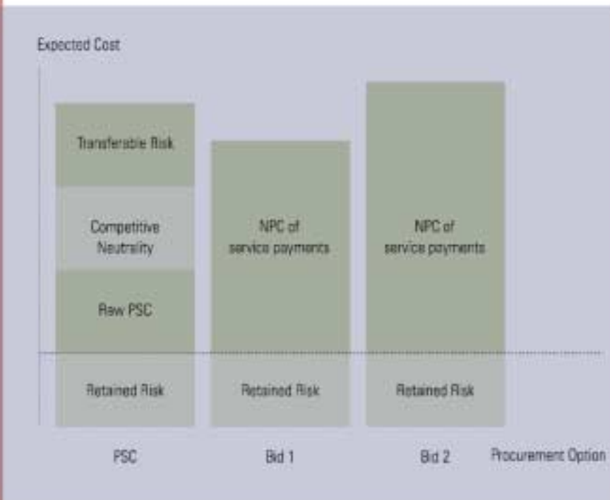
Figure 3: Value for money of PSC versus Partnerships Victoria bids

A private bid that proposes a more efficient delivery method than that identified in constructing the PSC should not cause an adjustment to the PSC to reflect that alternative delivery method. Such innovation is one of the benefits of Partnerships Victoria . By not adjusting the PSC, the value of the innovation will be explicitly recognised.